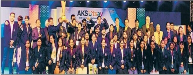
डॉ. भीमराव आंबेडकर विवि एसोसिएशन ऑफ इंडियन यूनिवर्सिटीज ने केंद्रीय जोनल युवा महोत्सव में नौ पुरस्कार जीते।

आगरा। डॉ. भीमराव आंबेडकर विश्वविद्यालय के छात्रों ने अपनी प्रतिभा की चमक एसोसिएशन ऑफ इंडियन यूनिवर्सिटीज के 36वें केंद्रीय जोनल युवा महोत्सव में दिखायी। एकएक विश्वविद्यालय सतना में हुए महोत्सव में विवि की सांस्कृतिक टीम ने नौ पुरस्कार जीते।