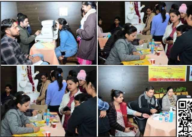
Health Camp organized by Women Cell