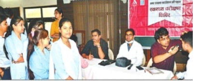
सेठ पयचंट जैन संस्थान में लगाए गए नेत्र शिथिल में छात्र-छात्रों का परीक्षण करते चिकित्सक।