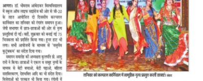
छात्राओं ने नृत्य से दिया बेटी बचाओ, बेटी पढ़ाओ का संदेश

विवि विद्यालय में जी-20 के तहत आयोजित कल्चरल कार्निवाल का समापन