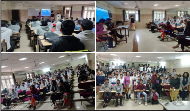
Students' participation in campaign on MOOCs courses