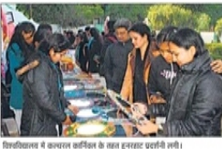
विद्यार्थियों ने कल्चरल कार्निवाल में भाग लिया।

आगरा। डॉ. भीमराव आंबेडकर विश्वविद्यालय में कोविड-19 के बाद पहली बार आयोजित होने वाले कल्चरल कार्निवाल का शुभारंभ आज हुआ। डॉ. भीमराव आंबेडकर विश्वविद्यालय में आयोजित कल्चरल कार्निवाल का शुभारंभ आज हुआ। डॉ. भीमराव आंबेडकर विश्वविद्यालय में आयोजित कल्चरल कार्निवाल का शुभारंभ आज हुआ।