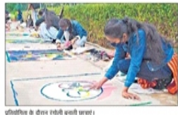
विद्यार्थियों ने कल्चरल कार्निवाल में भाग लिया।