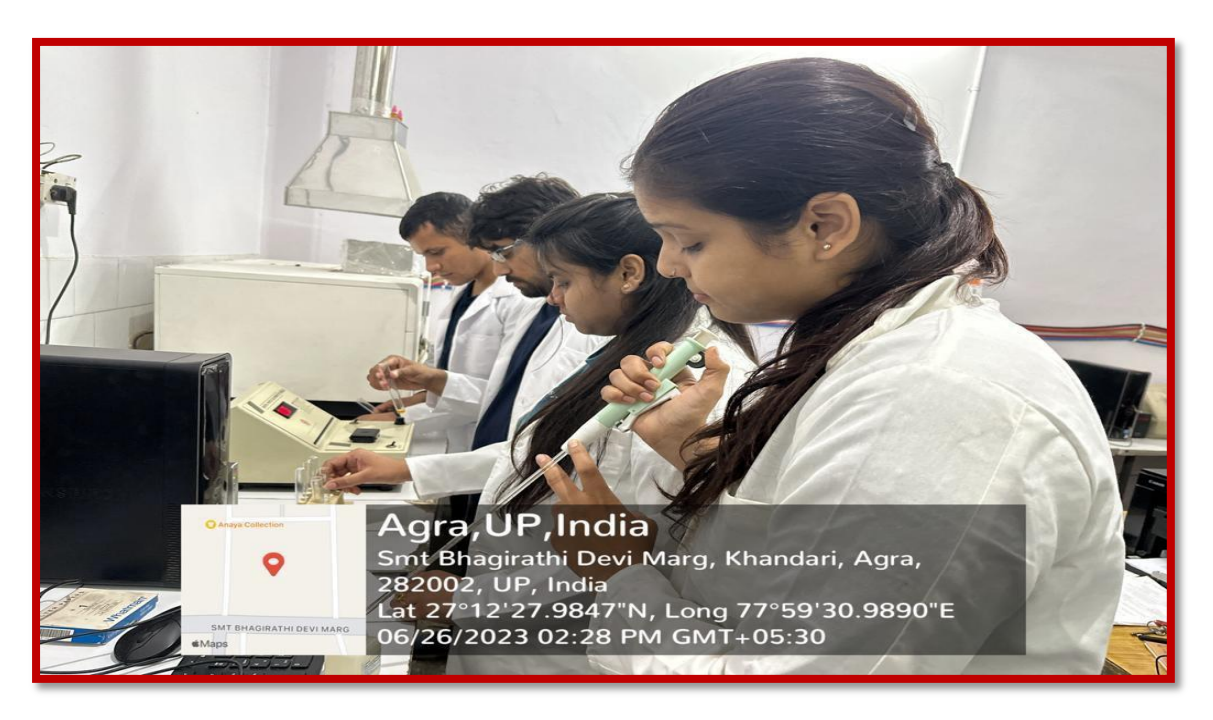
Fig 3. Students completed their research work in chemistry in 2023