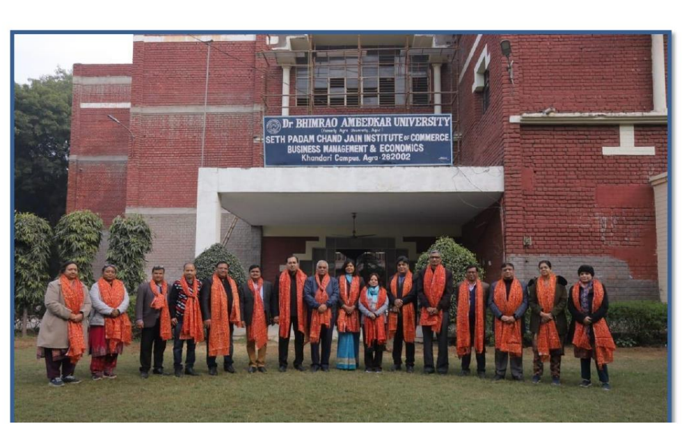
Alumni felicitation by the Director of the Institution

A State University of Uttar Pradesh (Formerly: Agra University, Agra) www.dbrau.ac.in