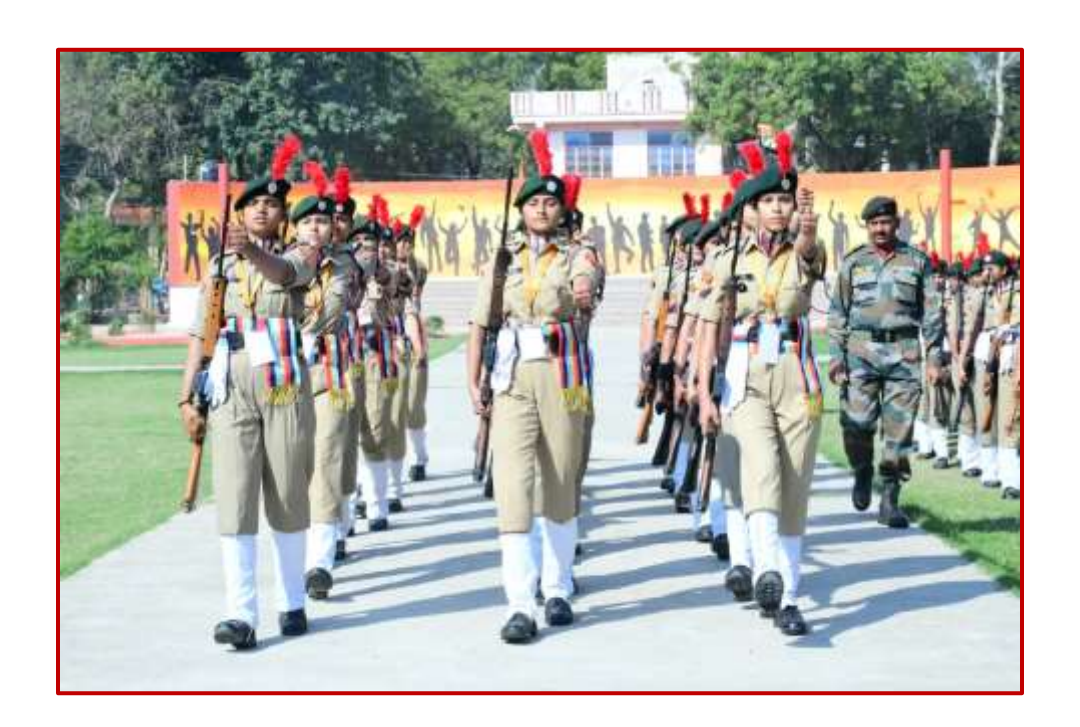
The NCC Cadets of Agra College doing March Past on 15 August 2022

A State University of Uttar Pradesh (Formerly: Agra University, Agra) www.dbrau.ac.in