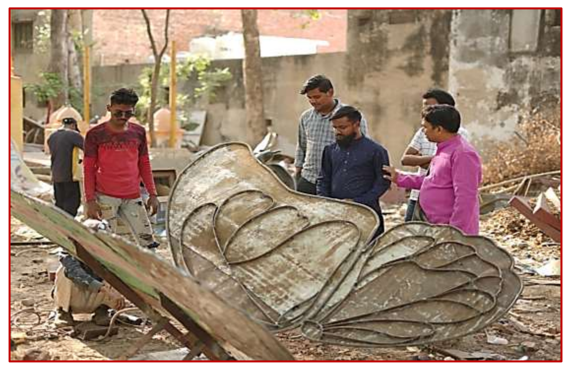
Sculpture department of University takes pride in its uniqueness by making beautiful decorative materials and artifacts