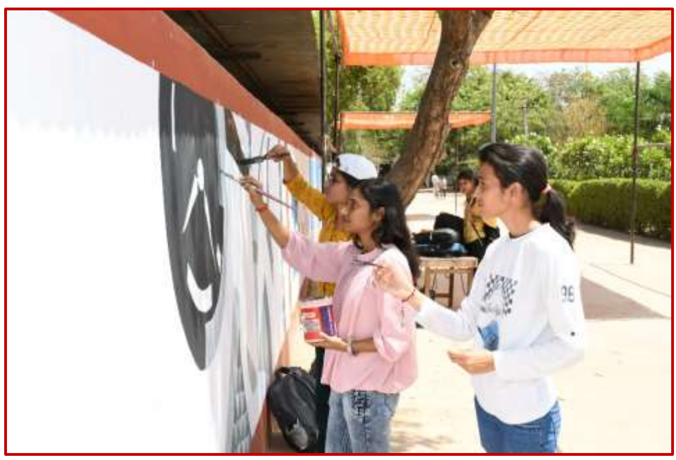
The students of Lalit Kala Sansthan volunteered in beautifying the walls of the entire campus of the university.