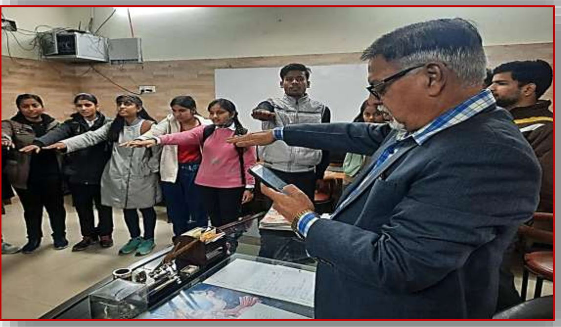
Vice Chancellor and Students are taking life pledge