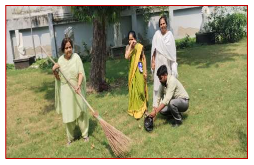
Faculty of Lalit Kala Sansthan contributing in the cleanliness drive held on 2 October 2022