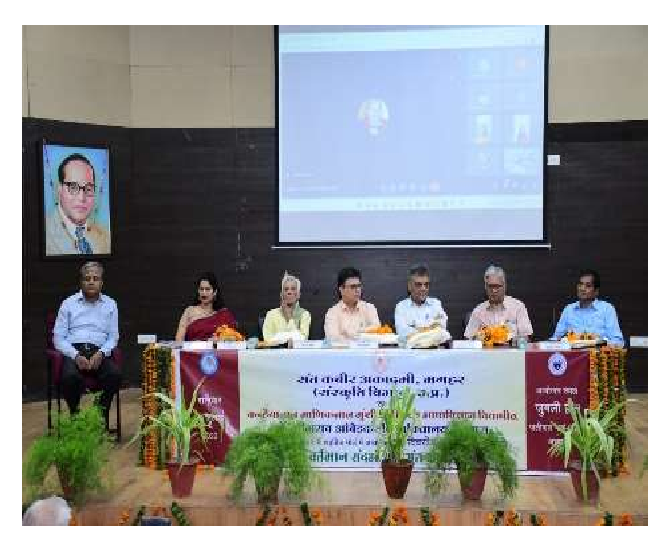
Pro Vice Chancellor cheered the session of International Conference organized by Department of Hindi in collaboration with Sant Kabir Academy Maghar, Sanskriti Vibhaag, UP.

The participation of the Pro Vice Chancellor in cheering the session of the International Conference organized by the Department of Hindi in collaboration with Sant Kabir Academy Maghar and Sanskriti Vibhaag, U.P, highlights the significance of the event and the university's commitment to academic collaboration and cultural exchange.