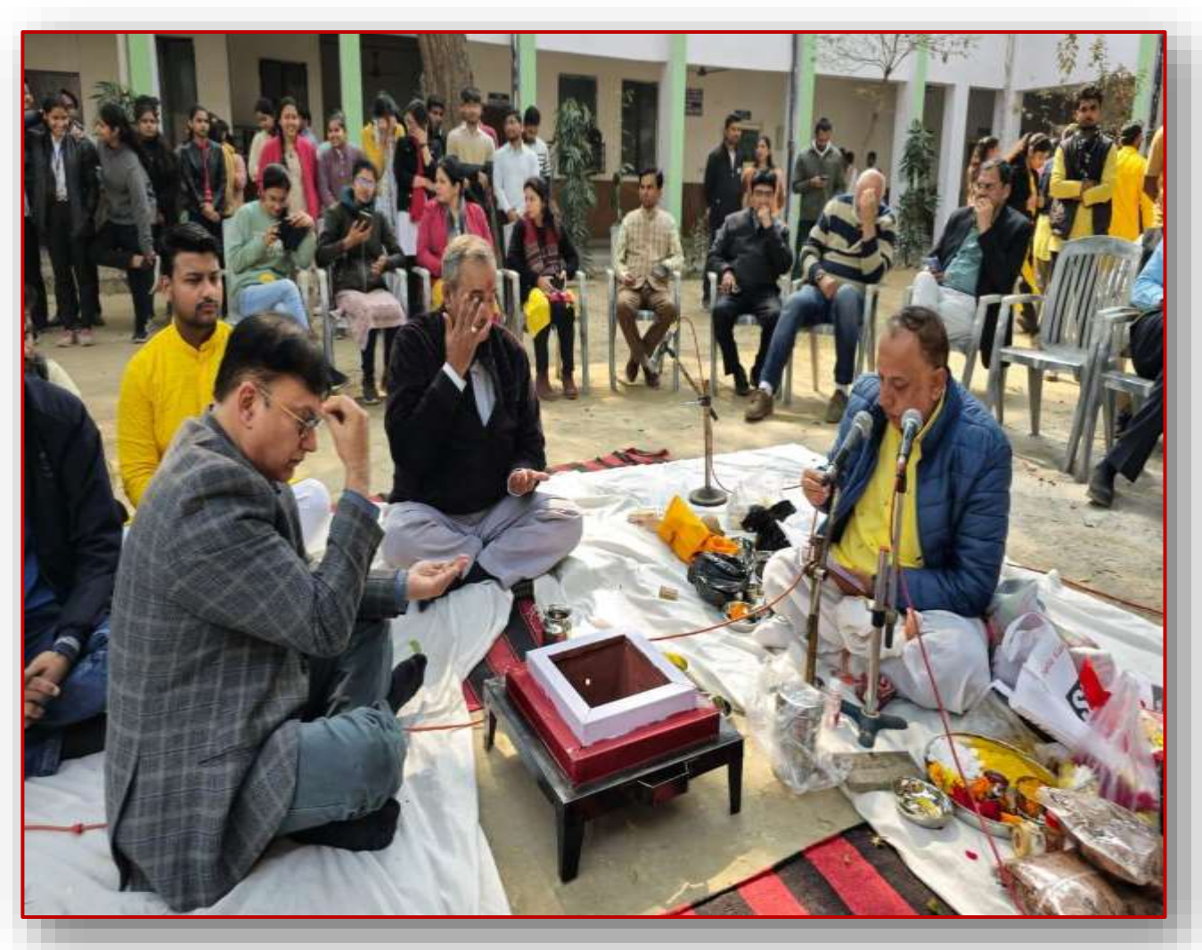
Pro Vice Chancellor, Directors and other teaching and non-teaching staffs are actively participating in Basant Panchami celebrations, engaging in prayers and rituals

"The university values and respects all religions, fostering an environment where diverse religious practices are embraced and celebrated together as a unified family. In accordance with our code of conduct, we organize religious ceremonies such as Yajna and Sunderkand Path on campus. By upholding our code of conduct while engaging in these practices, we demonstrate our commitment to fostering a supportive and respectful environment where everyone feels valued and accepted.