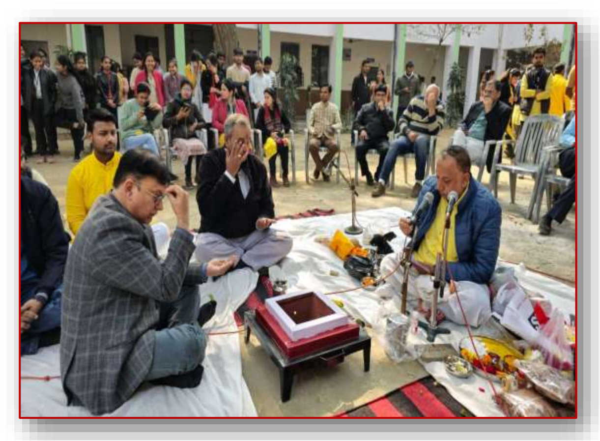
Pro Vice Chancellor, Directors and other teaching and non-teaching staffs are actively participating in Basant Panchami celebrations, engaging in prayers and rituals

"The university values and respects all religions, fostering an environment where diverse religious practices are embraced and celebrated together as a unified family. In accordance with our code of conduct, we organize religious ceremonies such as Yajna and Sunderkand Path on campus. By upholding our code of conduct while engaging in these practices, we demonstrate our commitment to fostering a supportive and respectful environment where everyone feels valued and accepted.