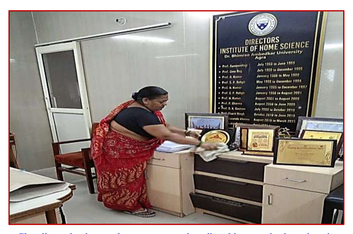
Cleanliness, hygiene and neatness are primarily taking care in the university