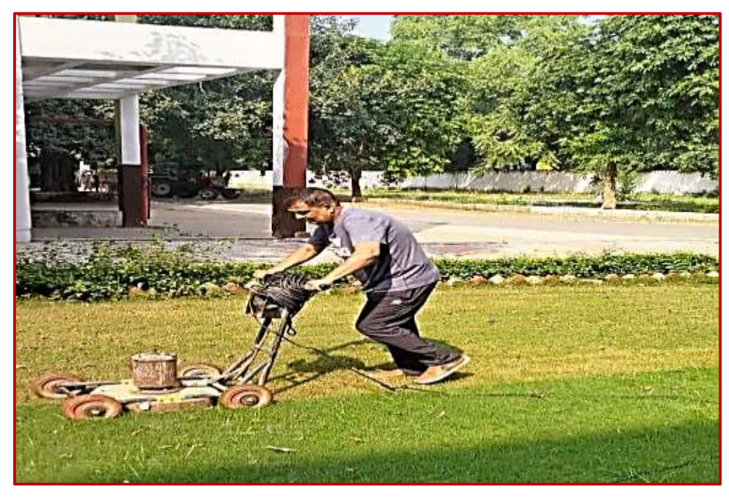
Teaching and the Non-Teaching Staff take initiatives to beautify the campus