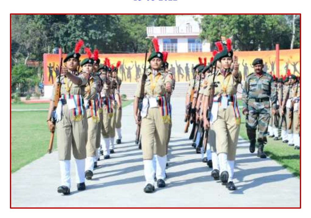
The NCC Cadets of Agra College doing March Past on 15 August 2022