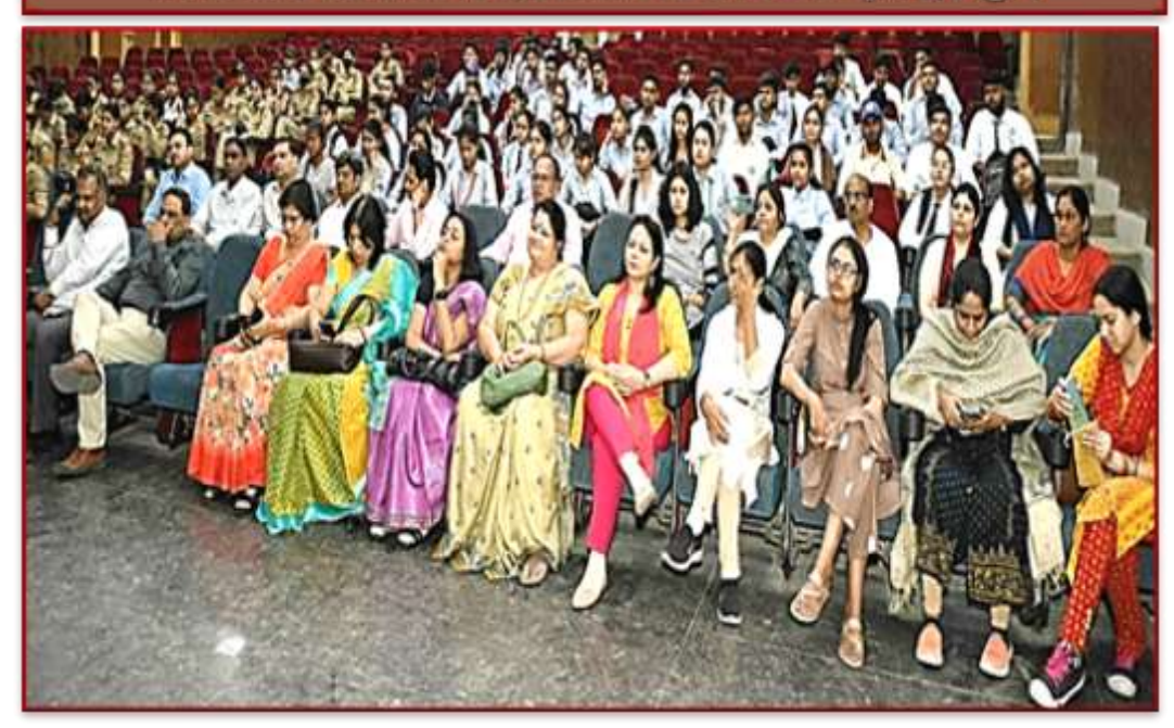
The Professional Ethics Program, attended by 254 teachers, administrators, and staff, was held at Jubilee Hall.

16<sup>th</sup> & 17<sup>th</sup> March, 2023 at 11 am. Venue: Jubilee Hall, Paliwal Park Campus, Agra