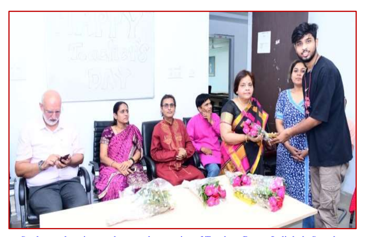
Student welcoming teachers on the occasion of Teachers Day at Lalit kala Sansthan on September, 5, 2022.

Celebrating Teachers' Day at the university is a heartfelt acknowledgment of the invaluable contributions that teachers make to the academic community and the lives of students. This special day provides an opportunity for students, faculty, and staff to express gratitude, admiration, and appreciation for the dedication, guidance, and mentorship provided by teachers.