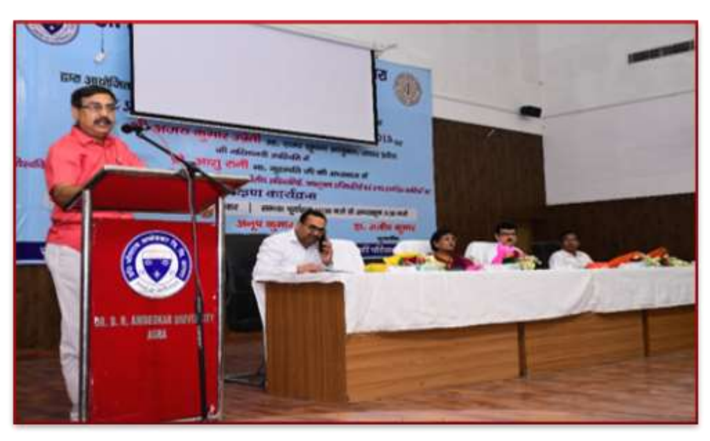
Honorable State Information Commissioner Shri Ajay Kumar Upreti addressing workshop on RTI-2005