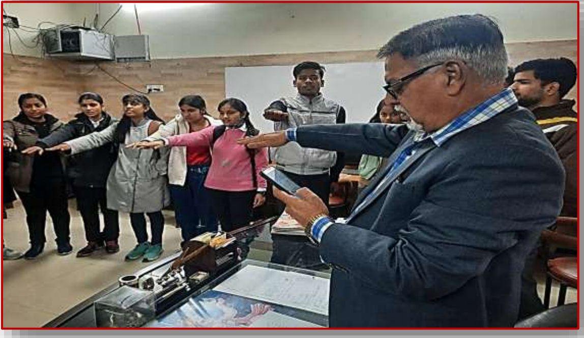
Vice Chancellor and Students are taking oath on constitutional day