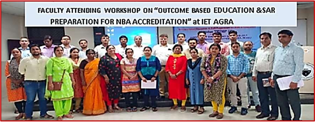
Organizing of Workshops, FDPs, Conferences, Seminars, Training Sessions etc. for the faculties are a regular part of university curriculum