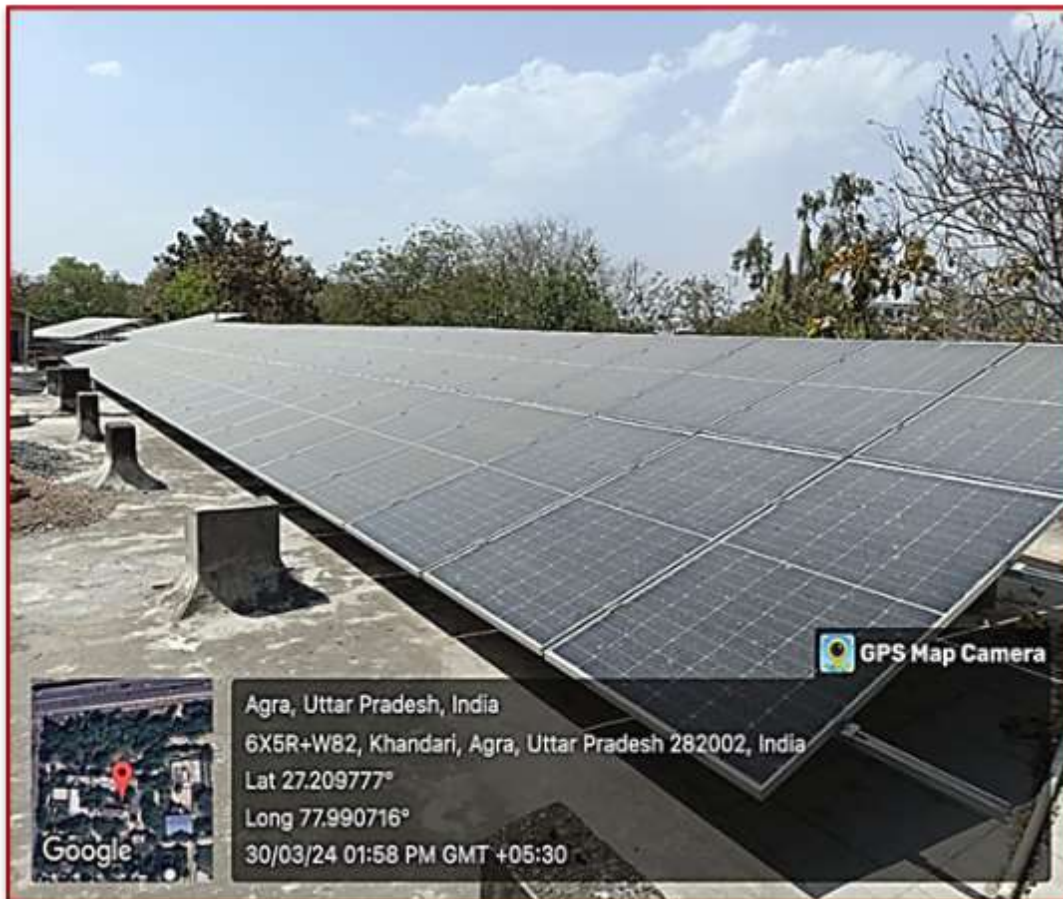
Solar Power System University Campus – 60KWh