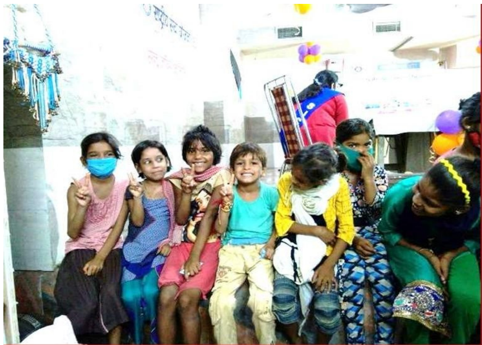
Bapu Bazar For Community Welfare and Empowerment

Sustainable Development Goal 1 (SDG 1), “No Poverty,” aims to eradicate poverty in all its forms and dimensions by 2030. As one of the world's most pressing challenges, poverty alleviation focuses on improving economic well-being, access to education, healthcare, and essential services for vulnerable populations. University has made significant strides in aligning its institutional efforts with SDG 1, fostering social and economic inclusion through various initiatives, programs, and partnerships.