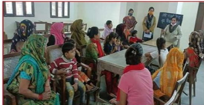
Awareness about Child Rearing Practices on 18/11/23