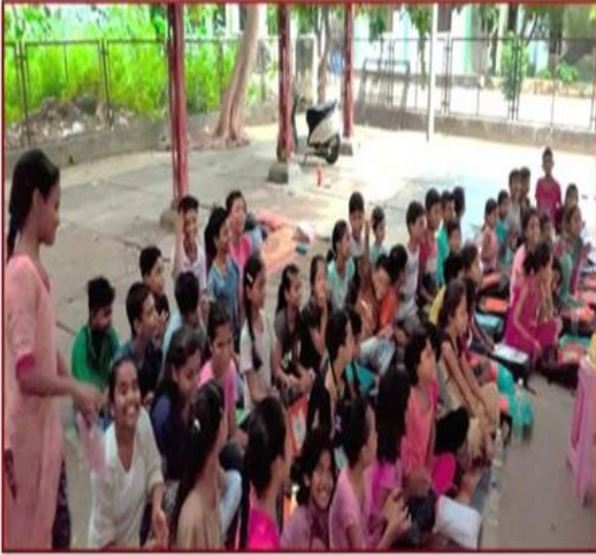
Fig: Students from nearby localities, enjoying studies in Vivekanand Academy: An Open air school being run in the evening in the university premises