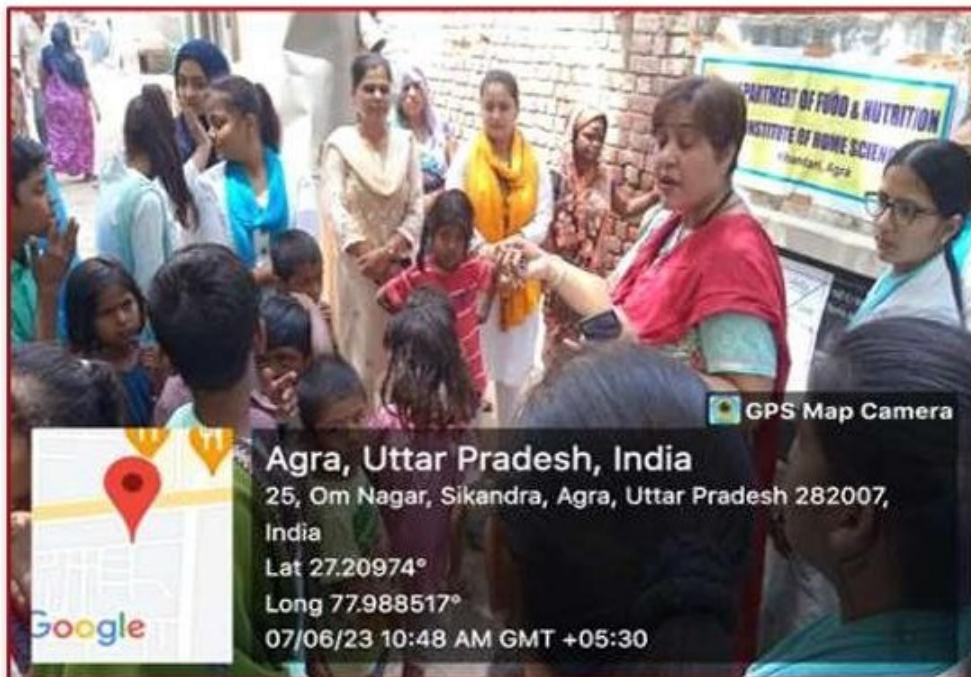
Talk on Iron Deficiency Disease in slum areas of Khandari on for weaker section children of nearby slum areas.