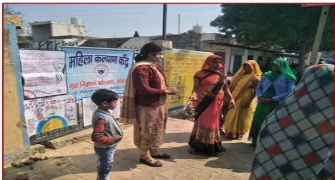
Awareness Program on Self Help Group at Village Khaspur on