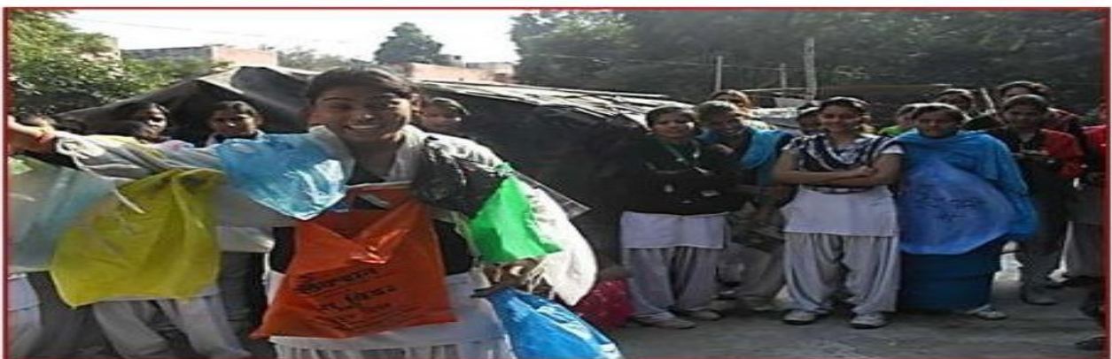
Nukkad Natak of "Say No to Plastic" in Slum areas of Agra on