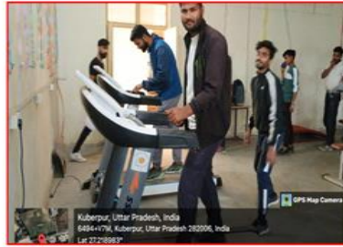
Facilities For Gym B) Two Sixteen point station performing specific workout. B) Facilities for treadmill for cardio workouts