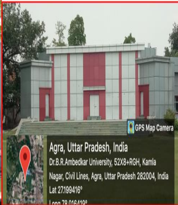
Fig. 35: 200 seating Auditorium ( Jublee Hall)