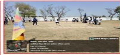
Outdoor Games Facilities A) Facilities for Long Jump B) Yoga Centre