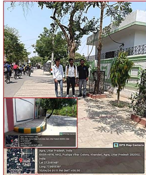
Pedestrian Friendly Pathway at different locations of the University