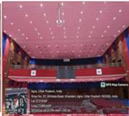
A). Shivaji Mandapam with LED lights B). Brishpati Bhawan with LED lights