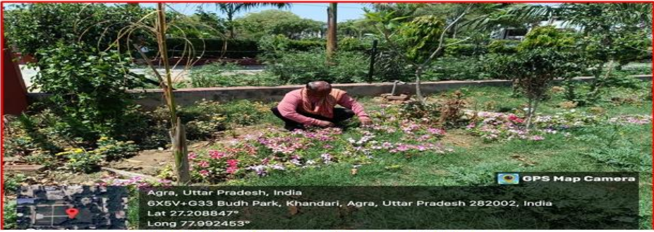
Fig. 8: Beautification of Campus with flowers