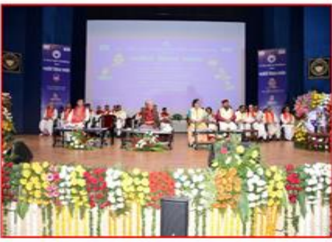
Auditorium Hall A. J.P Sabhagar B. Shivaji Mandapam