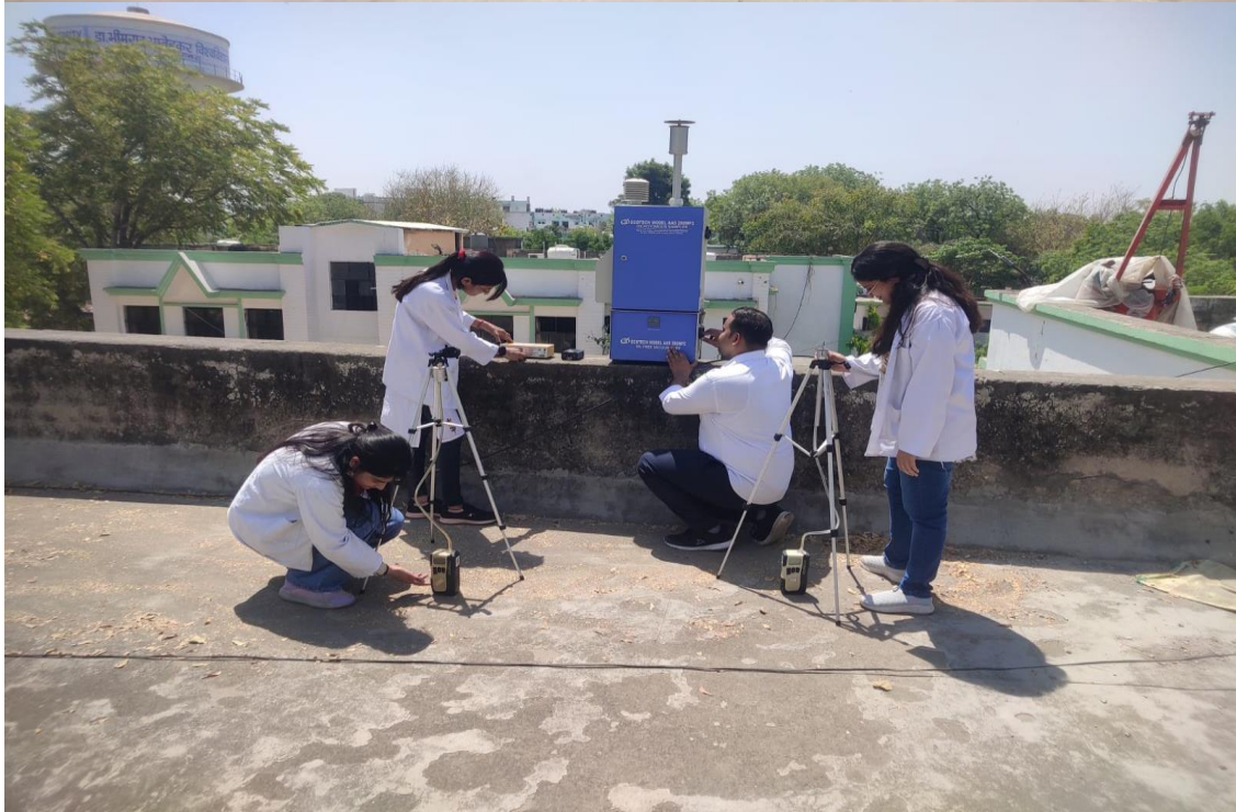
Research Scholar monitoring Air Pollution in Campus