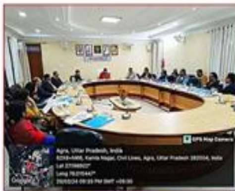
LED Lights at Shivaji Mandapam