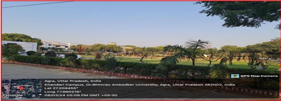
Fig. 7: Pruned Hedges