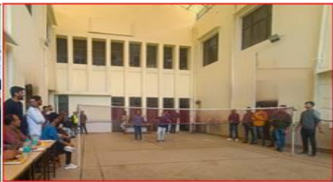
Indoor Games Facilities B) Facilities for Table Tennis. B) Facilities for Badminton