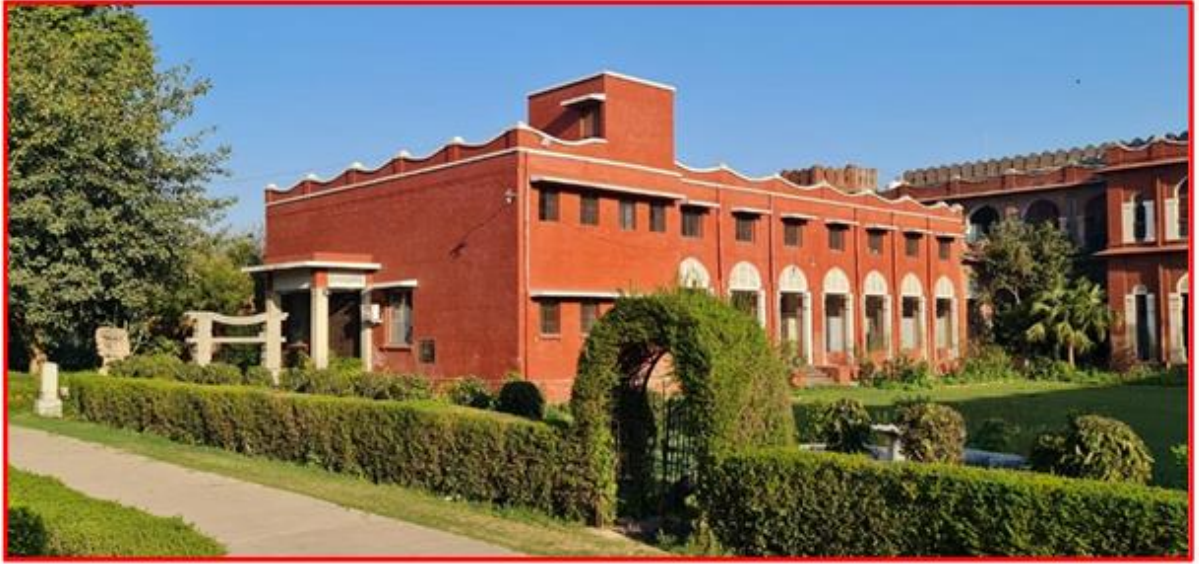
Recent Renovation of Heritage Building