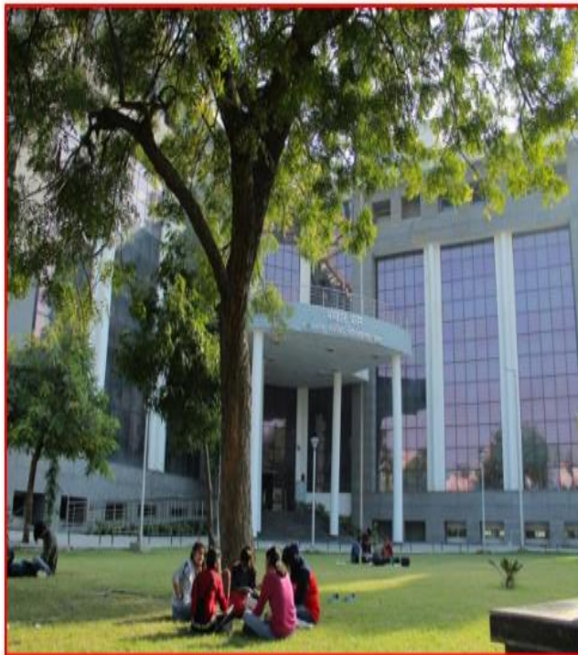
Fig. 37: 350 Seating Auditorium in Newest Building of the University