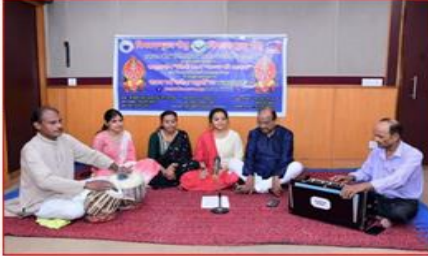
Recording Studio A). Recording Studio Equipments B). Recording of bhajan on trhe occasion of Ganesh Chaturthi