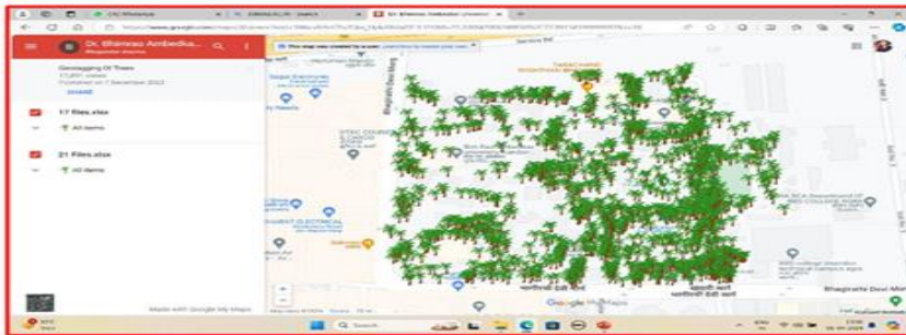
Geotagged Information available on university with common name and botanical name