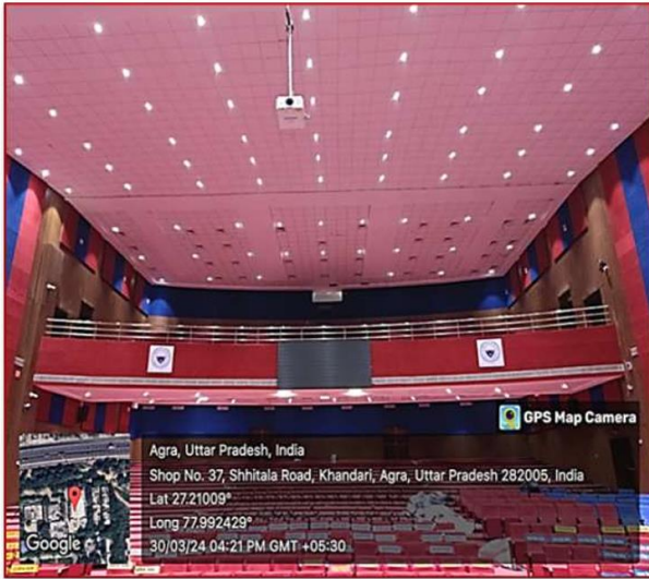
LED lights at Shivaji Mandapam