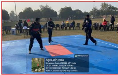
Facilities For Games A) Students Practicing Kabbadi. B) Sports Ground