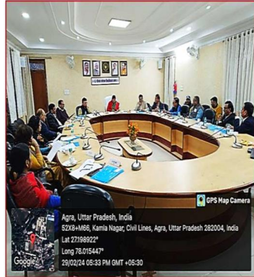
LED Lights at Brihaspati Bhawan