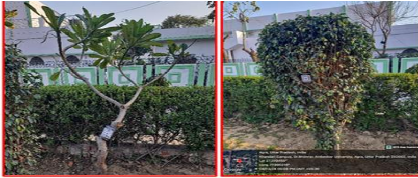
Maintenance (Pruning of Plants and Trees) geotagged