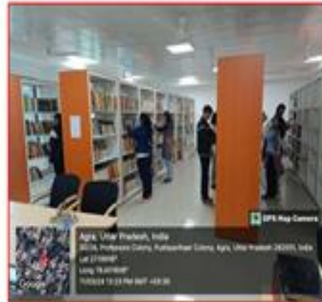
A). Stack room in library with LED lights B). Reading room with sufficient natural lights