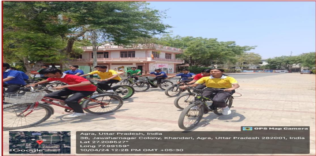
Use of Bicycles by the students