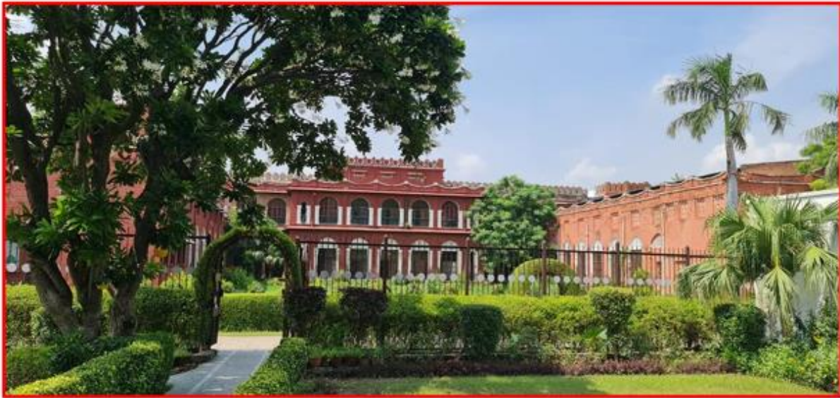
Heritage Building of University (Est. 1927)

Use of Led Bulbs/Power efficient equipment The University prioritizes eco-friendliness and energy conservation as fundamental obligations. As part of this commitment, LED lights have been deployed extensively across the campus, spanning laboratories, classrooms, offices, corridors, and roads. These LED fixtures offer remarkable energy efficiency, saving up to 90% of energy compared to traditional bulbs while delivering the same level of illumination. Currently, the university is actively transitioning towards achieving a fully LED-lit environment, aiming for a 100% LED lighting system across its facilities.