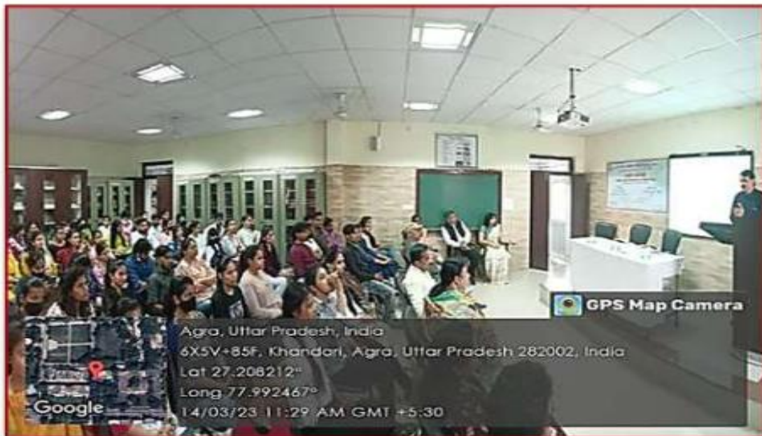
National Seminar on "International Day for Action on Rivers

This goal, aims to conserve and sustainably use the oceans, seas, and marine resources for sustainable development. Oceans cover over 70% of the Earth's surface, regulate the global climate, and provide essential resources, including food, livelihoods, and oxygen. However, marine ecosystems are under significant threat due to human activities such as pollution, overfishing, habitat destruction, and climate change.