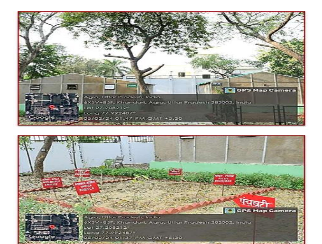
'Panchvati' Vatika at Khandari Campus