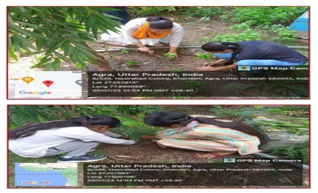
Students are cultivating a variety of vegetative plants and herbs in the kitchen garden