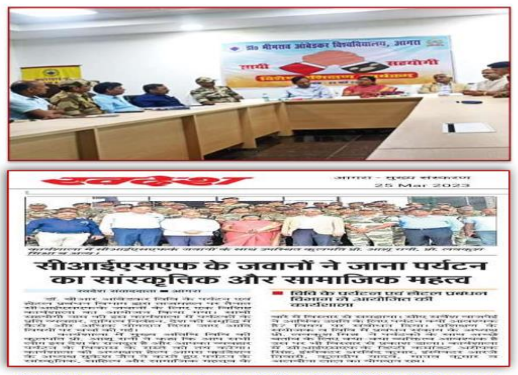
"Sathi -Sahyogi," was organized on March 17th and 24th, 2023, for CISF personnel nosted at the Tai Mahal to alleviate stress and promote tourist-friendly interactions.

• Sathi - Sahyogi Program for CISF Personnel 17 to 24 March 2023 The university has launched the Sathi-Sahyogi Program, aimed at providing support and assistance to CISF (Central Industrial Security Force) personnel. This initiative recognizes the invaluable contributions of CISF personnel in ensuring the safety and security of the community and seeks to express gratitude for their dedicated service.