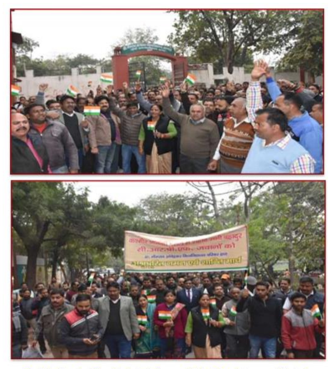
Participation of staff and students in Peace and Salute March to support Central Reserve Police Force

• Peace and Salute March 15 February 2019 The university's staff and students participated in a Peace and Salute March to honor and support the Central Reserve Police Force (CRPF). By joining together in this march, the university community expressed their gratitude and solidarity with the CRPF, emphasizing the importance of peace and unity in the face of adversity