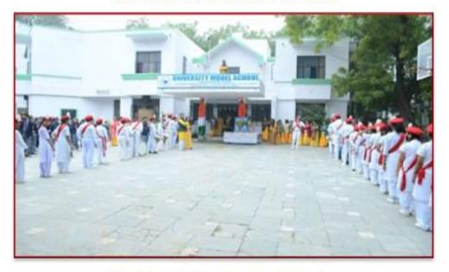
March Past on Independence Day Celebration